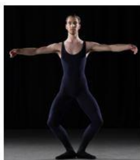
POSE 2 – Plié