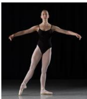
POSE 1 – Tendu Second Position