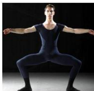
POSE 3 – Plié Second Position