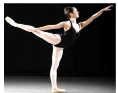
POSE 4 – First Arabesque